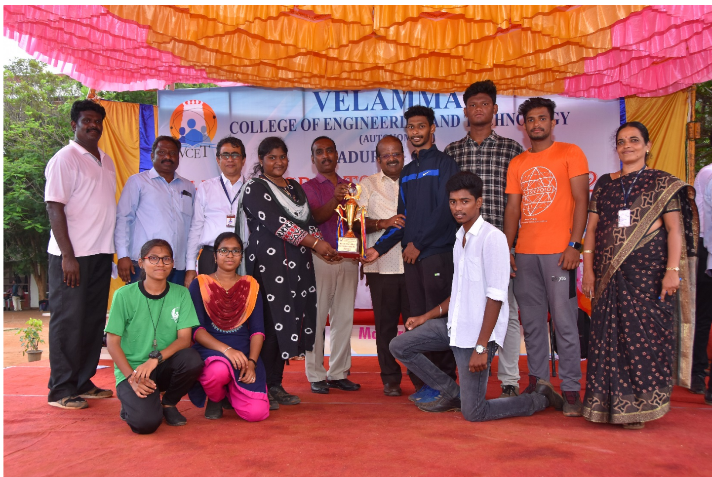
Runner-Green Grapes (Points 146)