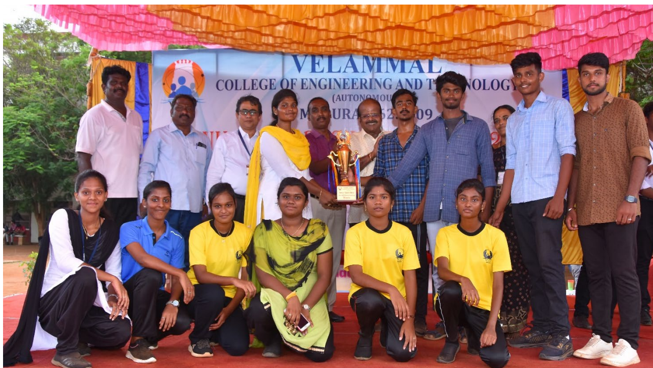
Winner-Yellow Plums (Points 150)