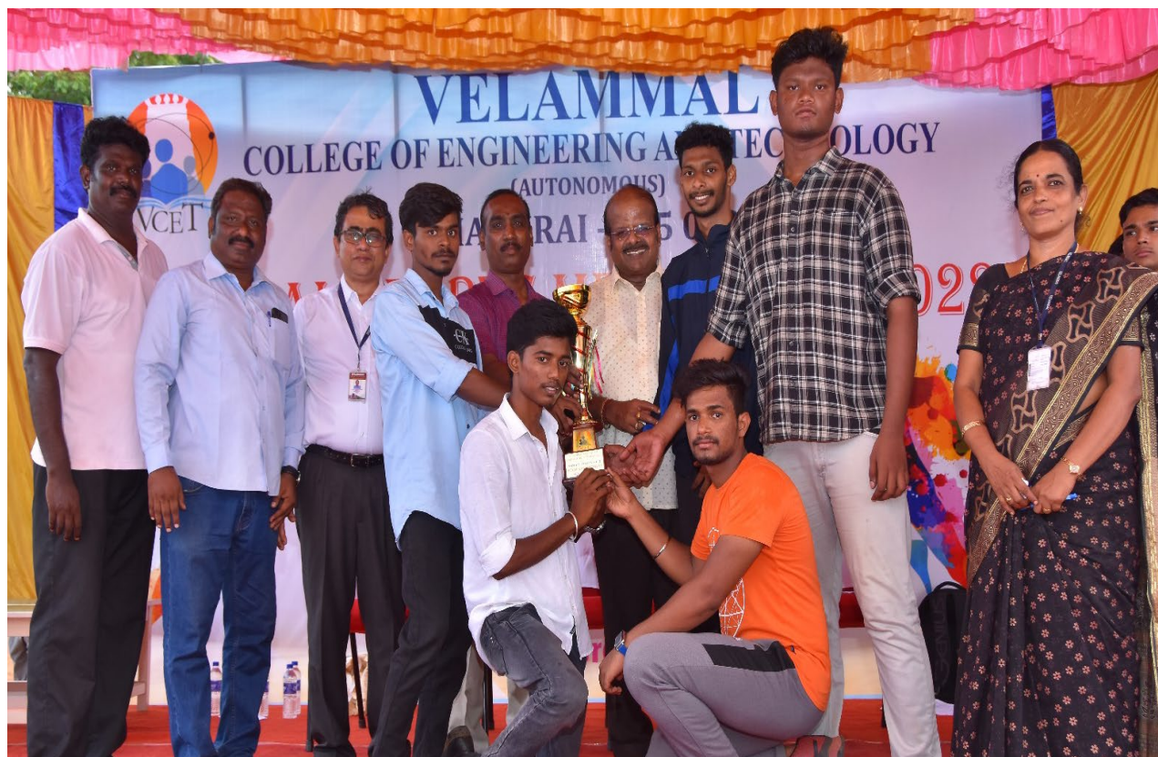
Men: Winners-Green Grapes (Points 94)