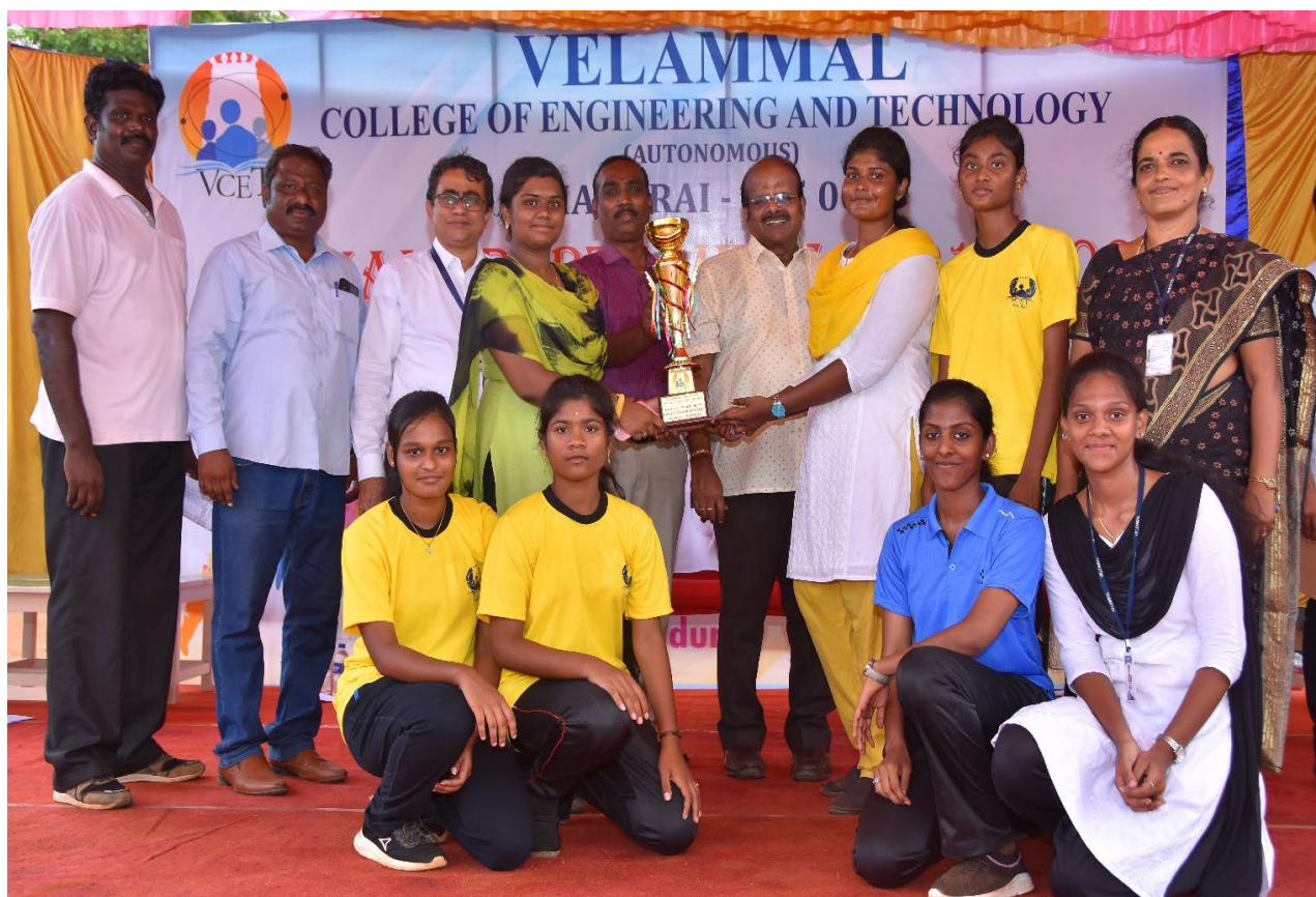
Women: Winners-Yellow Plums (Points 105)